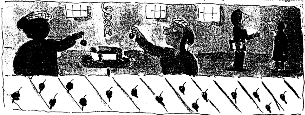
According to Taylor, managers should deal with workers individually – never collectively.